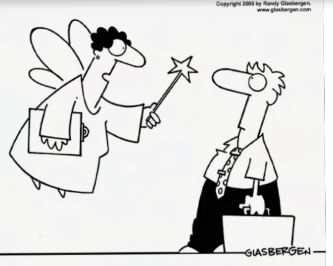
"After federal, state, and local taxes, you get one-third of a wish."